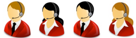
technicians from Redsoft