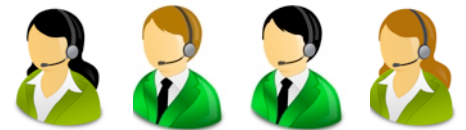
technicians from Greensoft